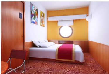
← Ocean View Staterooms