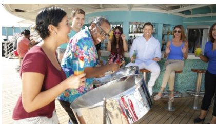
← All Day/Night Fun Onboard Activities →