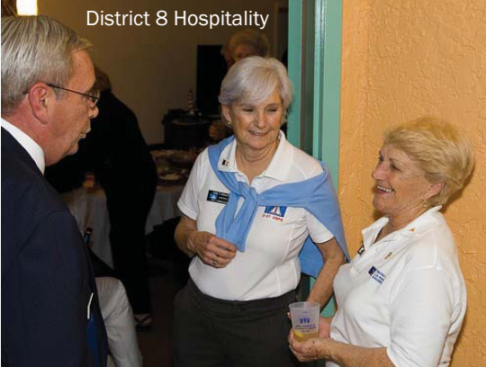
District 8 Hospitality