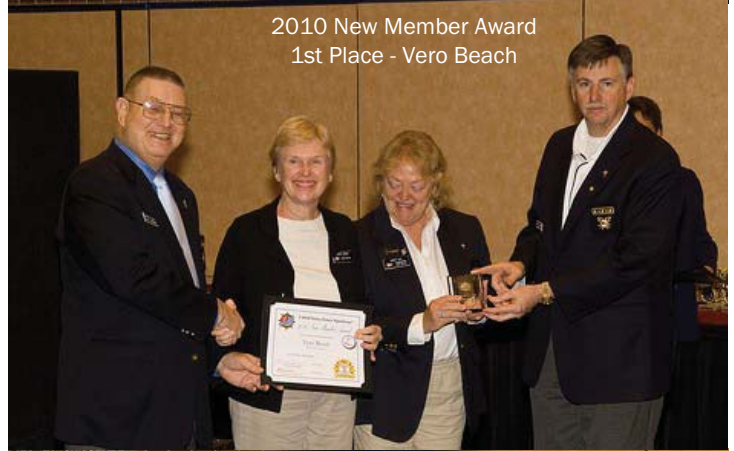
2010 New Member Award 1st Place - Vero Beach