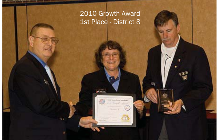
2010 Growth Award 1st Place - District 8