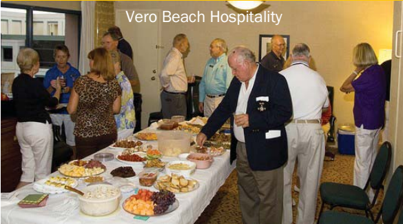
Vero Beach Hospitality