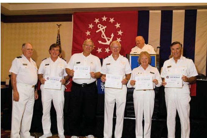
NEW The DOING IT RIGHT Award Coral Ridge, Key West, Marathon, Palm Beach & Vero Beach