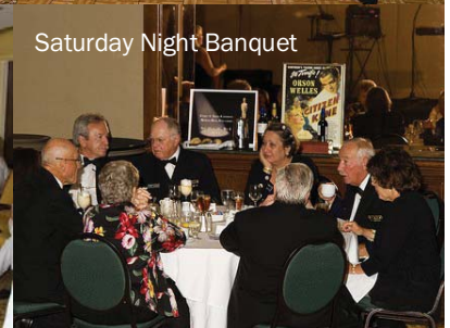
Saturday Night Banquet