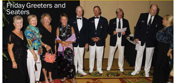
Friday Greeters and Seaters