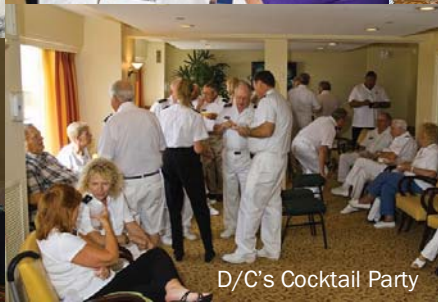
D/C's Cocktail Party