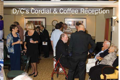
D/C's Cordial & Coffee Reception