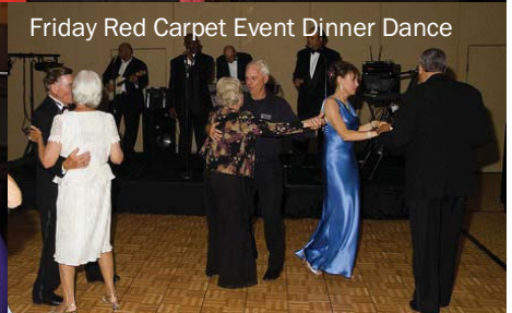
Friday Red Carpet Event Dinner Dance