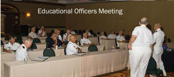
Educational Officers Meeting