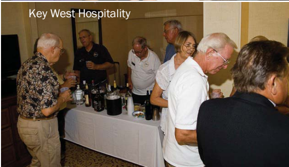
Key West Hospitality