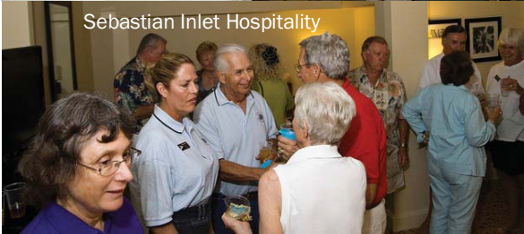
Sebastian Inlet Hospitality