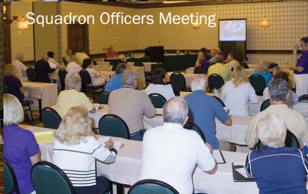
Squadron Officers Meeting