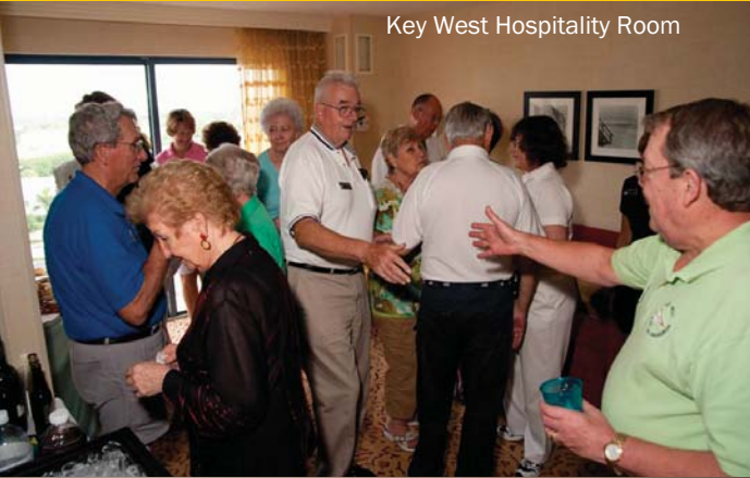
Key West Hospitality Room