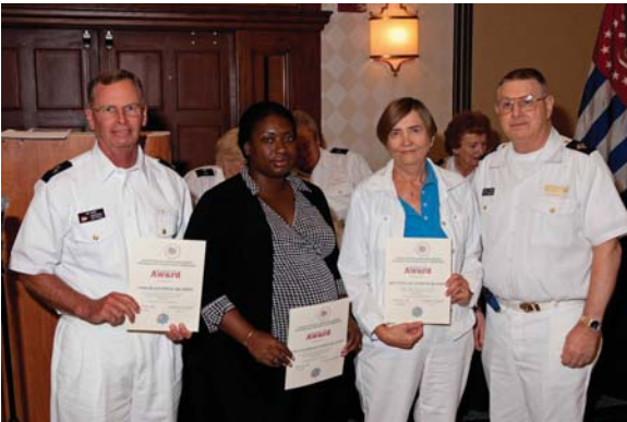
Website Award Vero Beach, Ft. Lauderdale and Key West squadrons