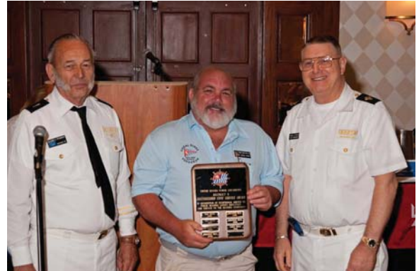
District 8 Civic Service Award - Coral Ridge S&PS