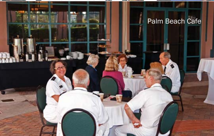
Palm Beach Cafe