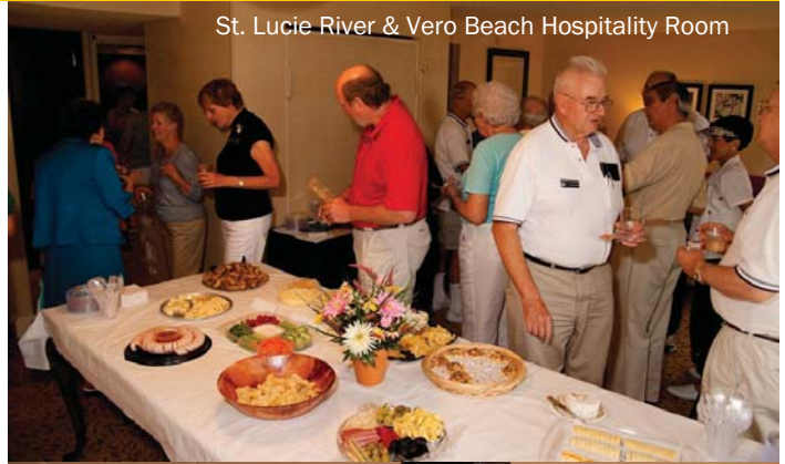
St. Lucie River & Vero Beach Hospitality Room