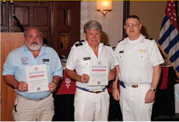
Website Excellence Award Coral Ridge and Pompano Beach squadrons