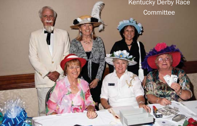
Kentucky Derby Race Committee