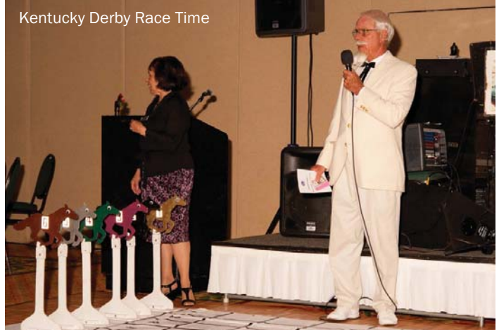
Kentucky Derby Race Time