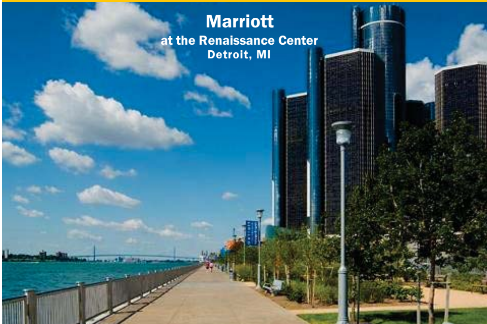
Marriott at the Renaissance Center Detroit, MI

http://www.flickr.com/photos/artdodd52/sets/72157630595423584/