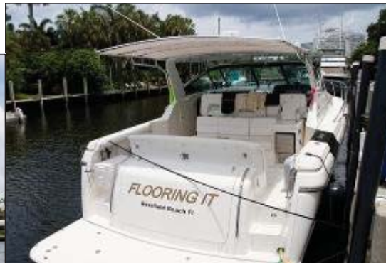
SOME OF THE BOATS AT THE RENDEZVOUS