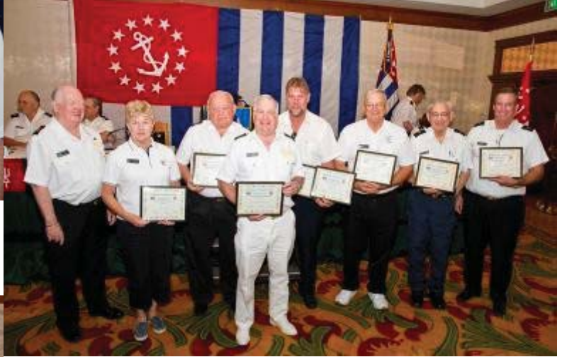
District 8 Certificates of Appreciation presented to