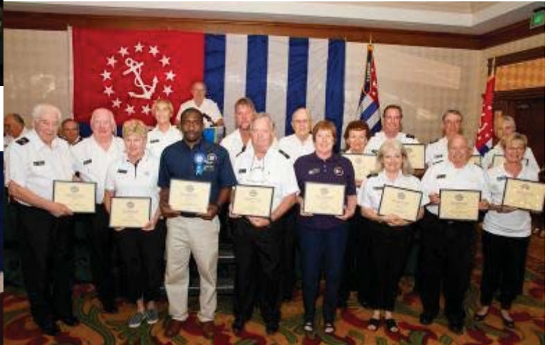
USPS Educational Fund Certificate of Merit