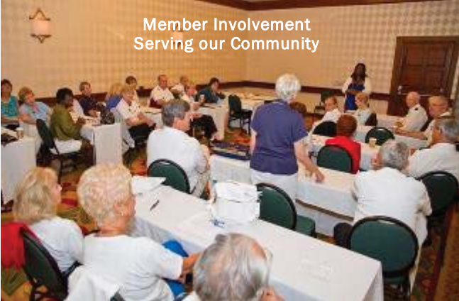
Member Involvement Serving our Community