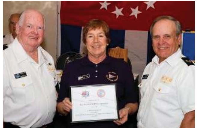
20 Years Cooperative Charting Key West Sail & Power Squadron