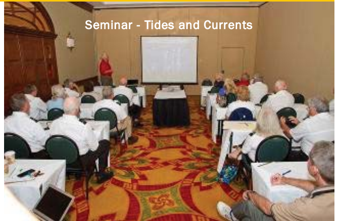
Seminar - Tides and Currents