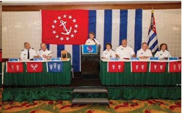
District 8 2013-2014 Bridge