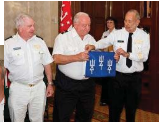
#1. Passed from the "Oldest" P/D/C down to...