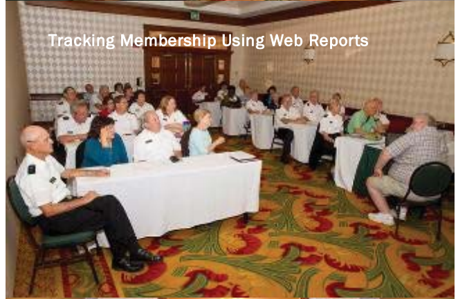
Tracking Membership Using Web Reports