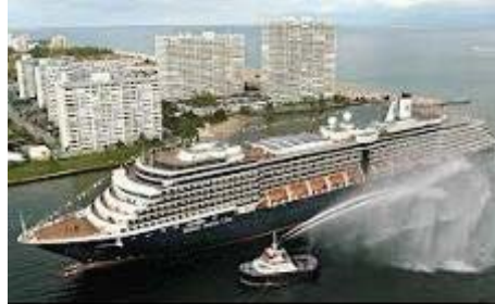
ms Nieuw Amsterdam

In case you didn't hear, USPS is having a Centennial Cruise following the Governing Board 2 - 9 February 2014. It is a 7-day roundtrip from Ft. Lauderdale cruising to the Eastern Caribbean. The itinerary includes the Grand Turk, Turks & Caicos; San Juan, Puerto Rico; St Thomas, USVI; and Half Moon Cay, Bahamas.