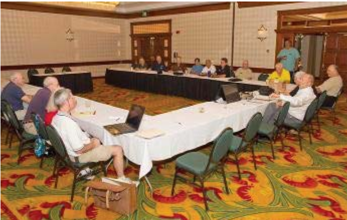
Photo below: Educational Department Meeting at the Spring Conference

The Chapman award nominations are due to the DEO by 15 July. This is our most prestigious award in Education. Each squadron should have a nomination. The details and forms are found at USPS.org on the Educational Department home page under Chapman award.