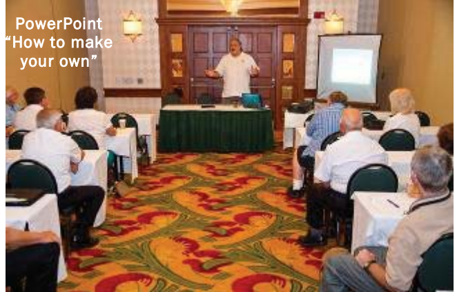
PowerPoint "How to make your own"