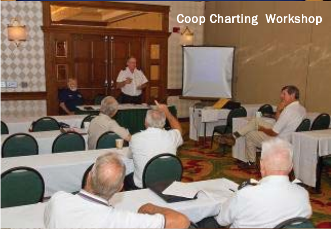
Coop Charting Workshop