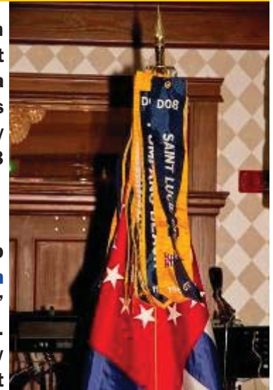
D/8 100 Year Ensign with all squadron banners attached.