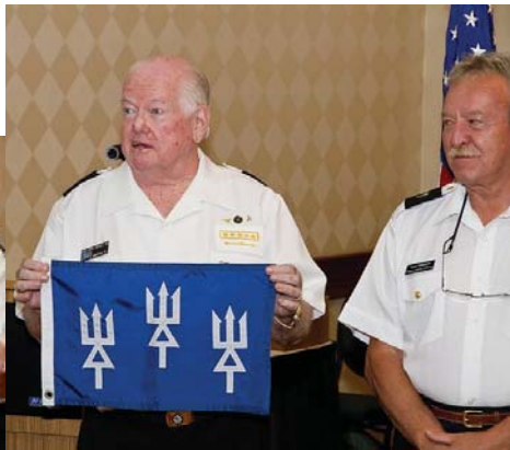
#2. ...the "Newest" P/D/C ...