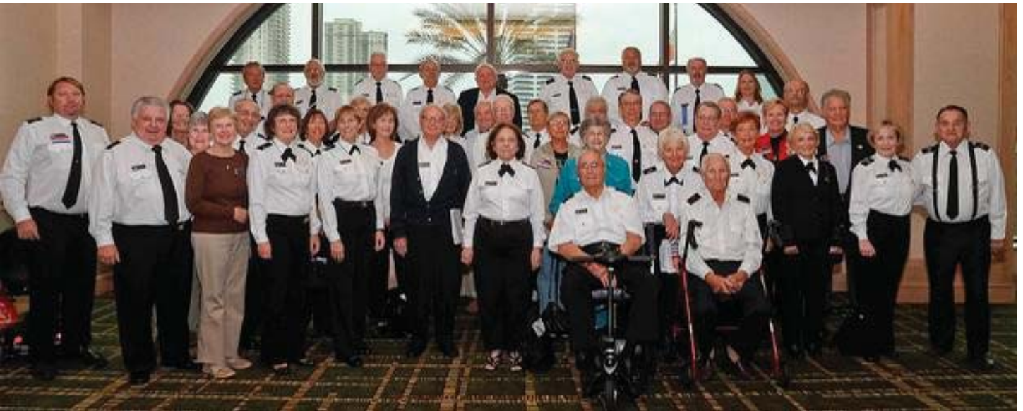
Below: District 8 group during the Annual Meeting recess.