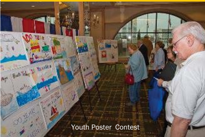
Youth Poster Contest

To view/save all photos of the National Meeting go to: http://www.flickr.com/photos/artdodd52/sets/72157640774654665/