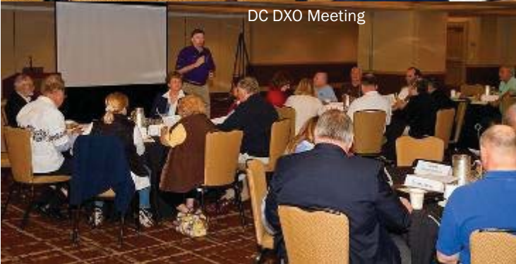
DC DXO Meeting