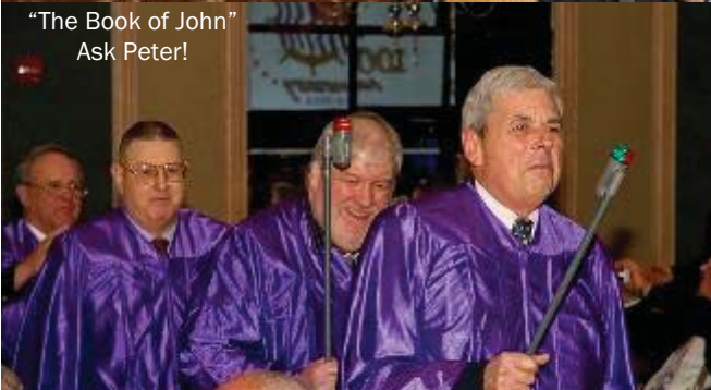
"The Book of John" Ask Peter!