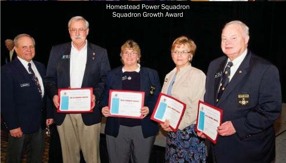
Homestead Power Squadron Squadron Growth Award