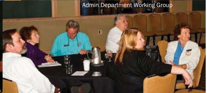
Admin Department Working Group