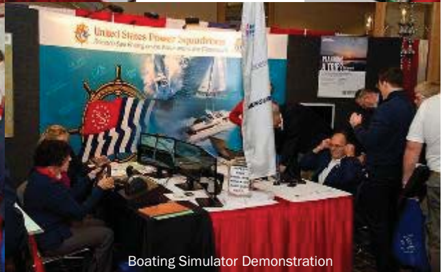
Boating Simulator Demonstration

To view/save all photos of the National Meeting go to: http://www.flickr.com/photos/artdodd52/sets/72157640774654665/