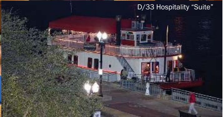
D/33 Hospitality "Suite"