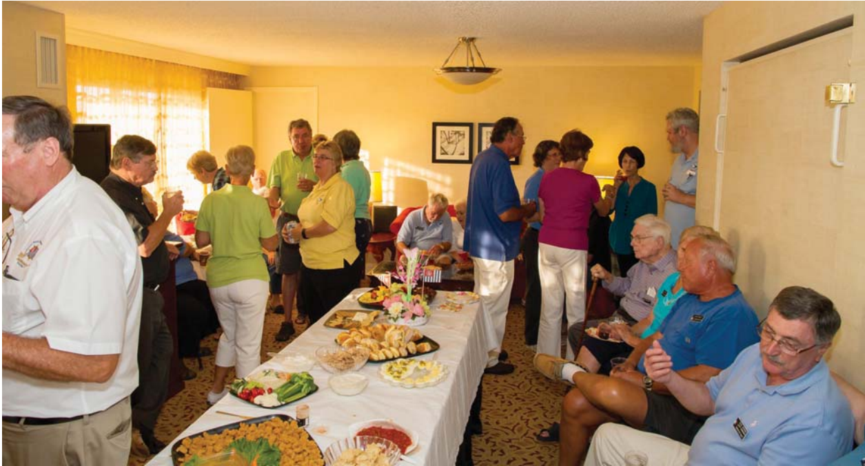
Palm Beach Hospitality