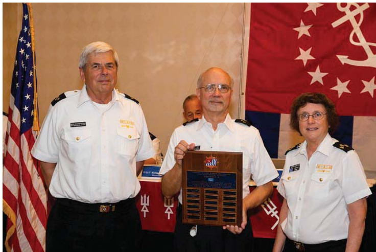
District 8 Civic Service Award, St. Lucie River

At the National Meetings this year, D8 won 1st Place "Member Involvement Retention Award" and 1st Place Boat US Civic Service Award. St Lucie River Power Squadron received honorable mention. As that made them the highest ranking D8 squadron at the National Level it meant they received the D8 Civic Service Award.