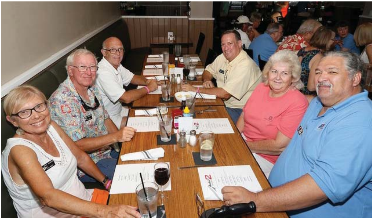
Dinner at Shula's