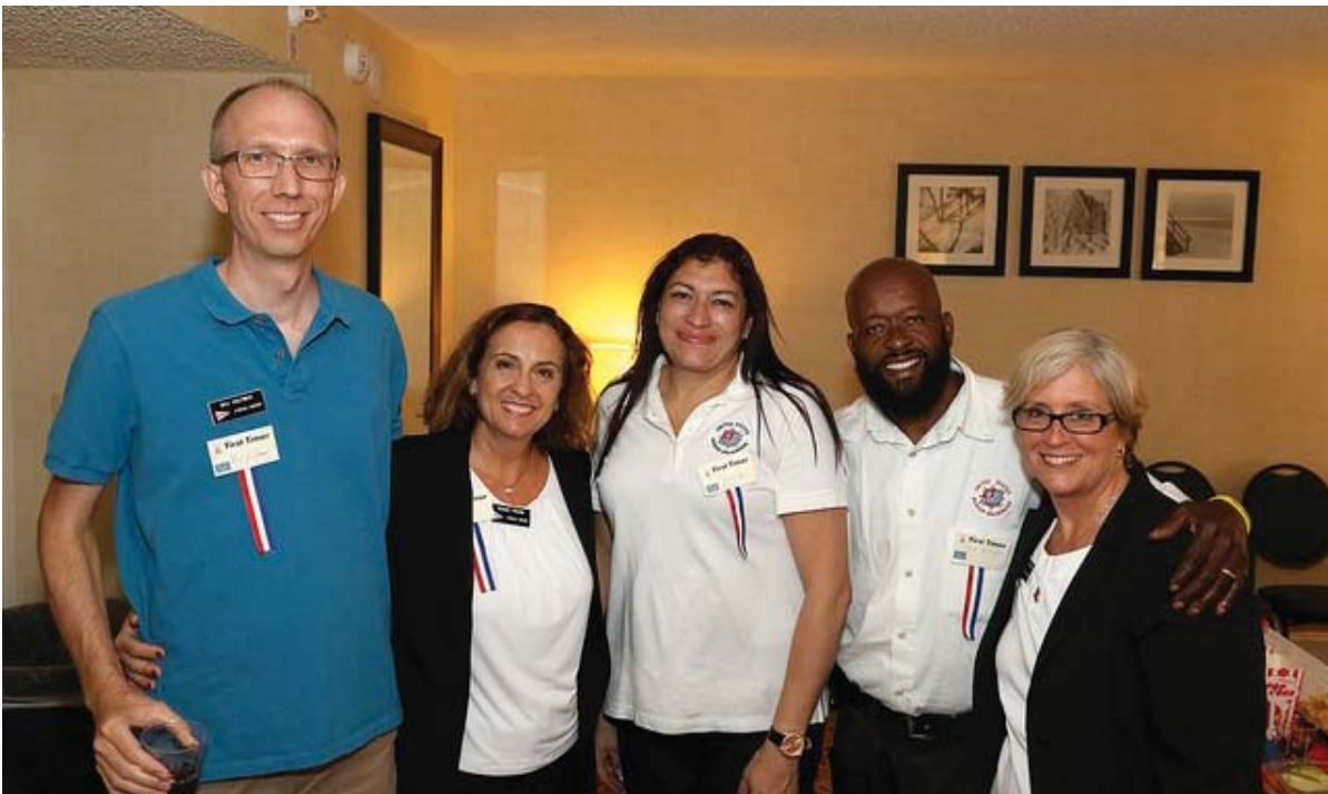
First Timers Reception