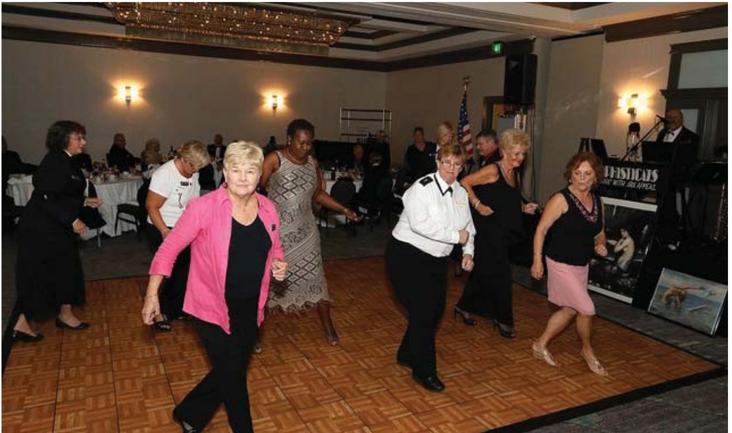
Night of fun dancing the Electric Slide