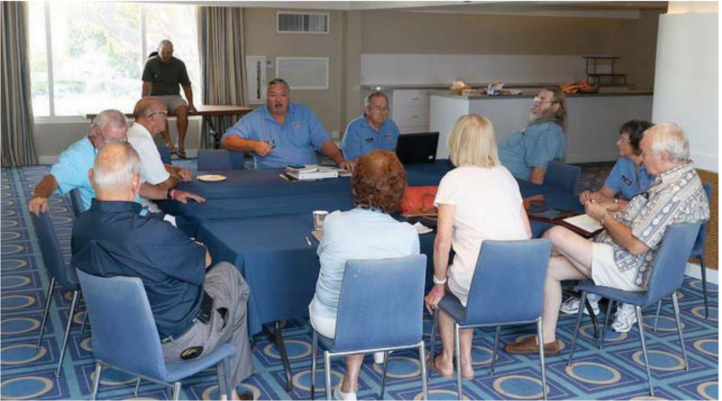
Saturday Morning Meeting